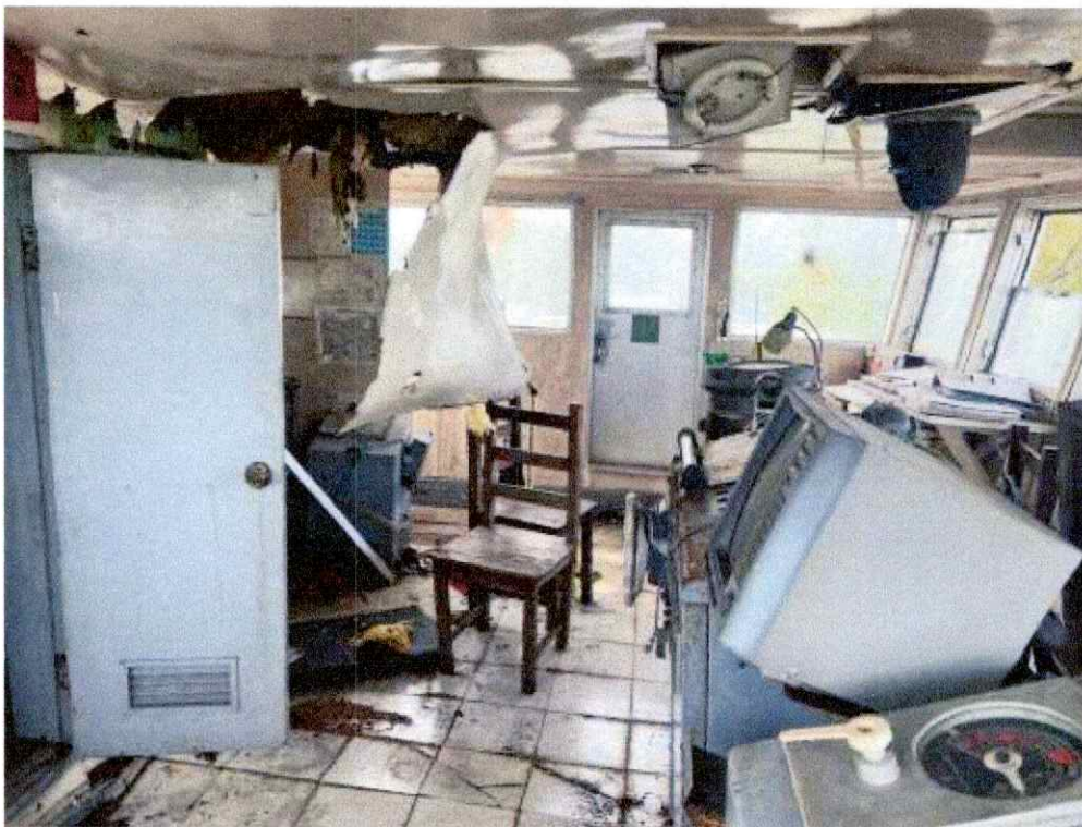
Photograph # 4: "BOROCHO" interior of the pilothouse