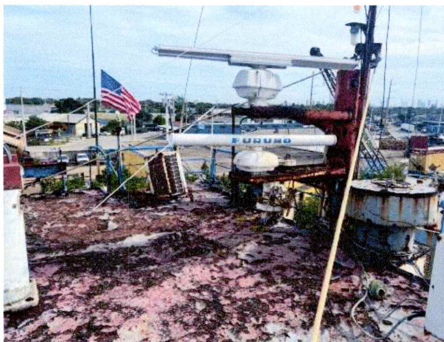
Photograph # 2: "BOROCHO" the pilothouse roof