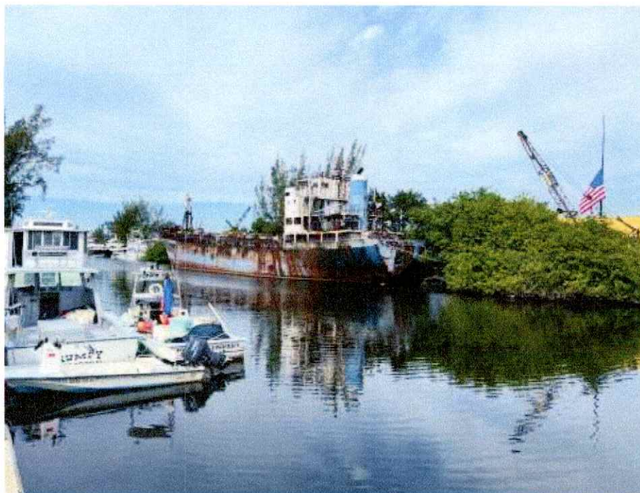
Photograph # 1: "BOROCHO" afloat at Miami Iron and Metal Company, on the Miami River, Florida, November 29, 2023