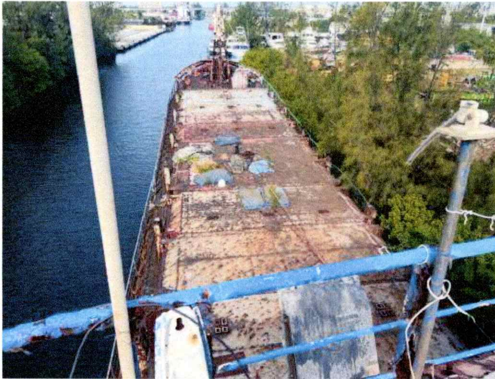
Photograph # 3: "BOROCHO" hold hatch covers and foredeck from the pilothouse roof